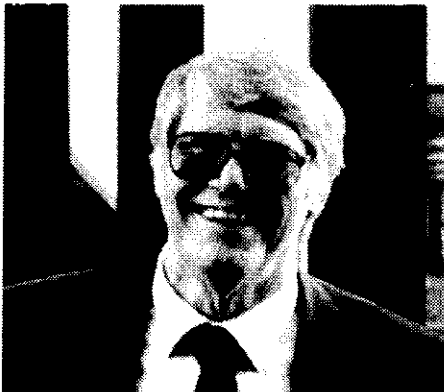
Retires cont. on page 6